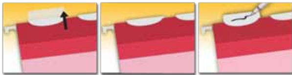
Tabs Lift Up Easily