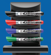
85377 EnduraGilde® Marker Caddy

OFFER LIMIT: ONE REDEMPTION PER BOARD PURCHASE. MUST PURCHASE BETWEEN 1/1/14 - 12/31/14