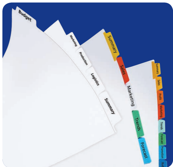
Index Maker® Clear Label Dividers

Treat yourself with a Target® Gift Card!