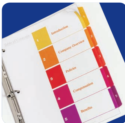
Ready Index® Multicolor Table of Contents Dividers